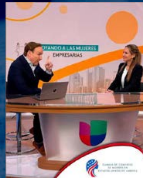
NOTICIAS 23 UNIVISION