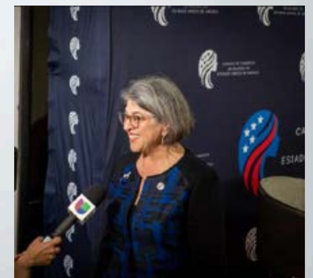
+10 local media attendees