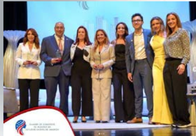
Gentleman of the year, Entrepreneur of the year and Leader of the year Awards.