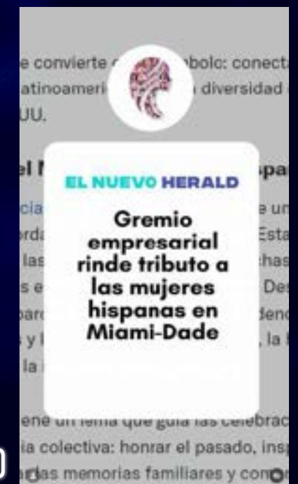
EL NUEVO HERALD