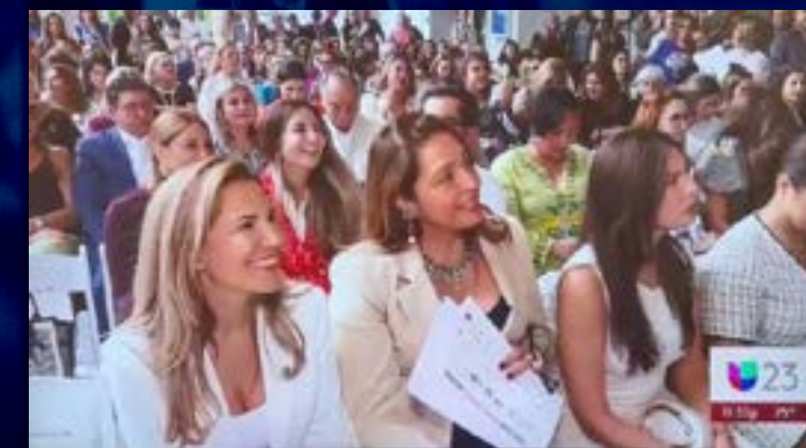
DESPIERTA AMERICA UNIVISION